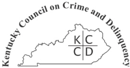
Front left of t-shirt.